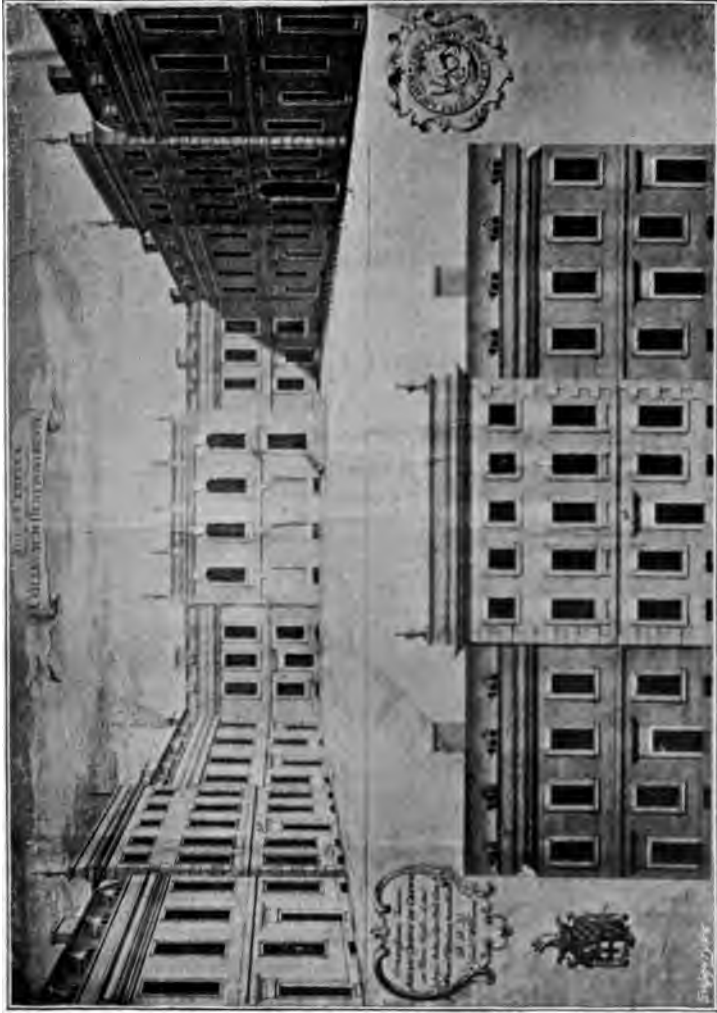
From a photograph by the